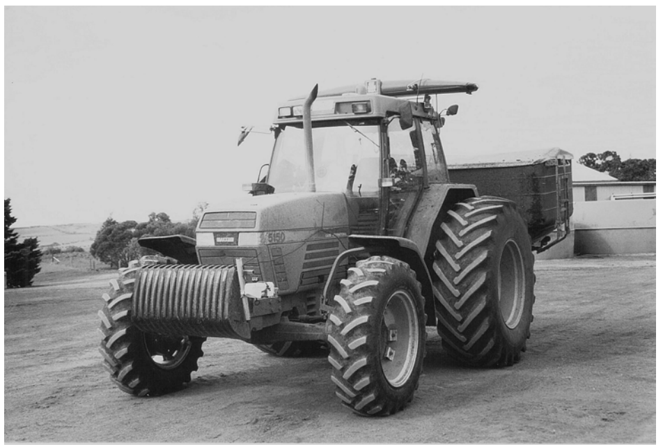
Figure 2. Yarra N Sensor on roof coupled to Bogballe VRT spreader and NTech GreenSeeker on front weights of tractor

For the last two years my brother Leet has made available to us Landmarks NTech GreenSeeker enabling us to compare the biomass maps from different machines in the same paddock.